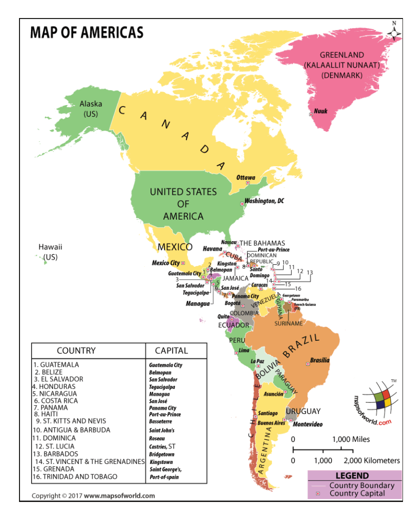
<u>Maps of the World</u> <<u>https://www.mapsofworld.com/americas/</u>>