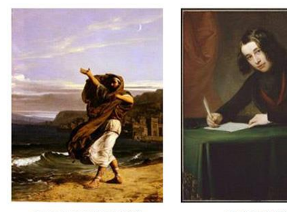
Demosthenes Practising Oratory (1870) Details of Presentation

Charles Dickens (1842) Details of Term Paper [2]